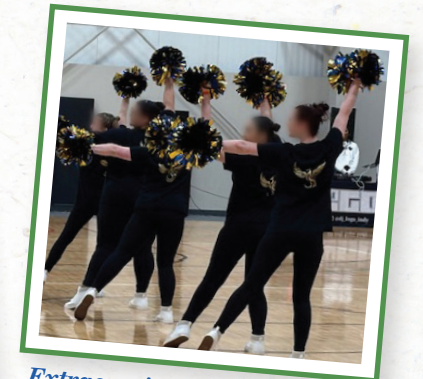
Extracurricular activities, like our dance team, improve motivation and leadership skills.