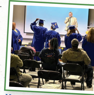
Many of our grads tell us they are first in their families to earn a diploma.