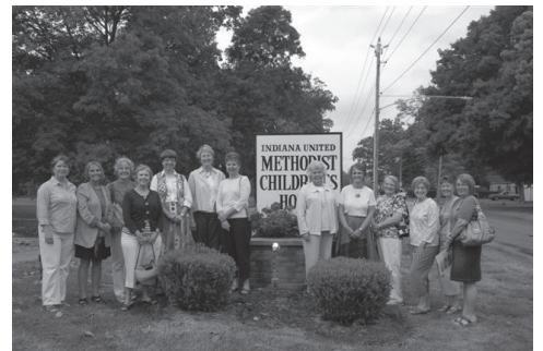
Nashville United Methodist Women toured Indiana United Methodist Children's Home in September. According to one of the members, "So many times we hear about the important work taking place at Indiana United Methodist Children's Home. But, when touring the campus and observing the school, it is evident that we are supporting a vital ministry within the United Methodist Church in Indiana."